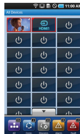
Figure 3. Mobile management enables full management and monitoring functions with the Extended Software Package.

In addition, with Virtual Network Computing (VNC), administrators can remotely monitor, control and approve LFD content. From a central location, administrators can view, manage and schedule content, and fix malfunctions remotely. With mobile management for MagicInfo Premium Server, users can deliver information to multiple locations. Administrators can use web browsers or smartphones to remotely publish content to MagicInfo Premium Players within LFDs.