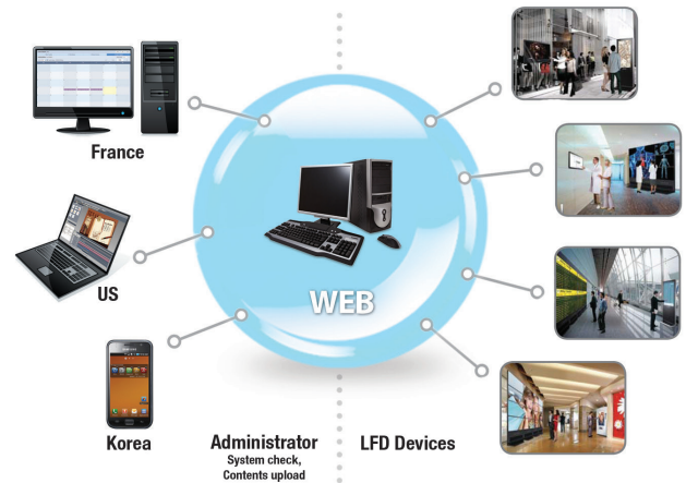
Figure 2. Administrators can schedule and view content, and manage all network devices from one interface.

MagicInfo Premium provides integrated, end-to-end content creation and management features. As a result, businesses can plan and design their digital signage infrastructure effectively and productively to meet increasingly diversified needs. With the embedded MagicInfo Premium S Player, users can create, schedule and play standalone content. When used with MagicInfo Premium Server, the embedded MagicInfo Premium S Player enables users to perform basic network and device management tasks. MagicInfo Premium i Player and MagicInfo Premium Server support device management with database integration and mobile management, as well as content scheduling and playback.