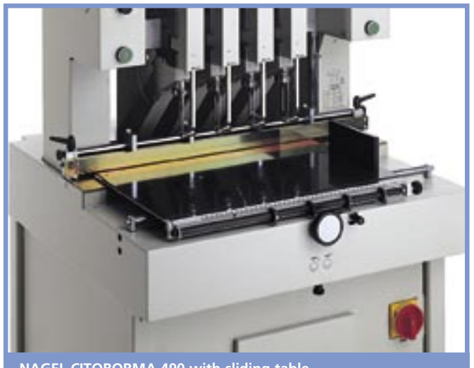
NAGEL CITOBORMA 490 with sliding table.

A sliding table enables the Citoborma 490 to drill multiple perforations.