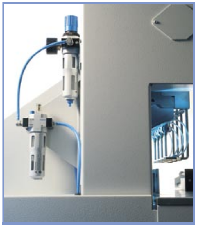
Professional drill bit lubrication with cooling system.

The Nagel Citoborma 490 has the equipment for your special requirements. Special drill heads permit drilling of non-standard patterns in one stroke, even with minimum hole spacing. Other assets are the infinitely variable drilling speed and lifting speed, the drill bit lubrication with cooling system and the foot switch operation.